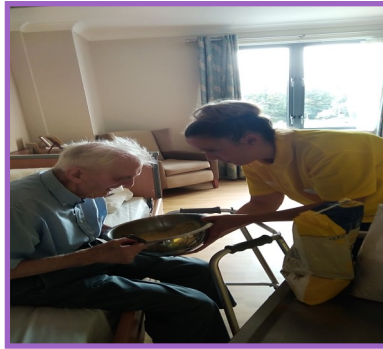
Making cakes and soup brings back good memories