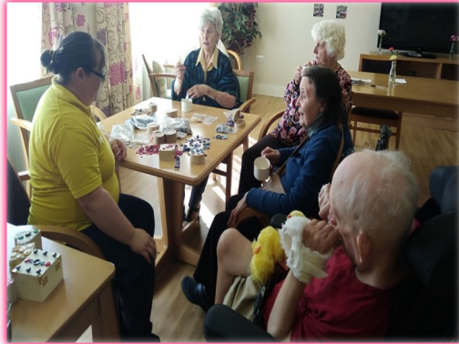
Residents are making 'Button Boxes'